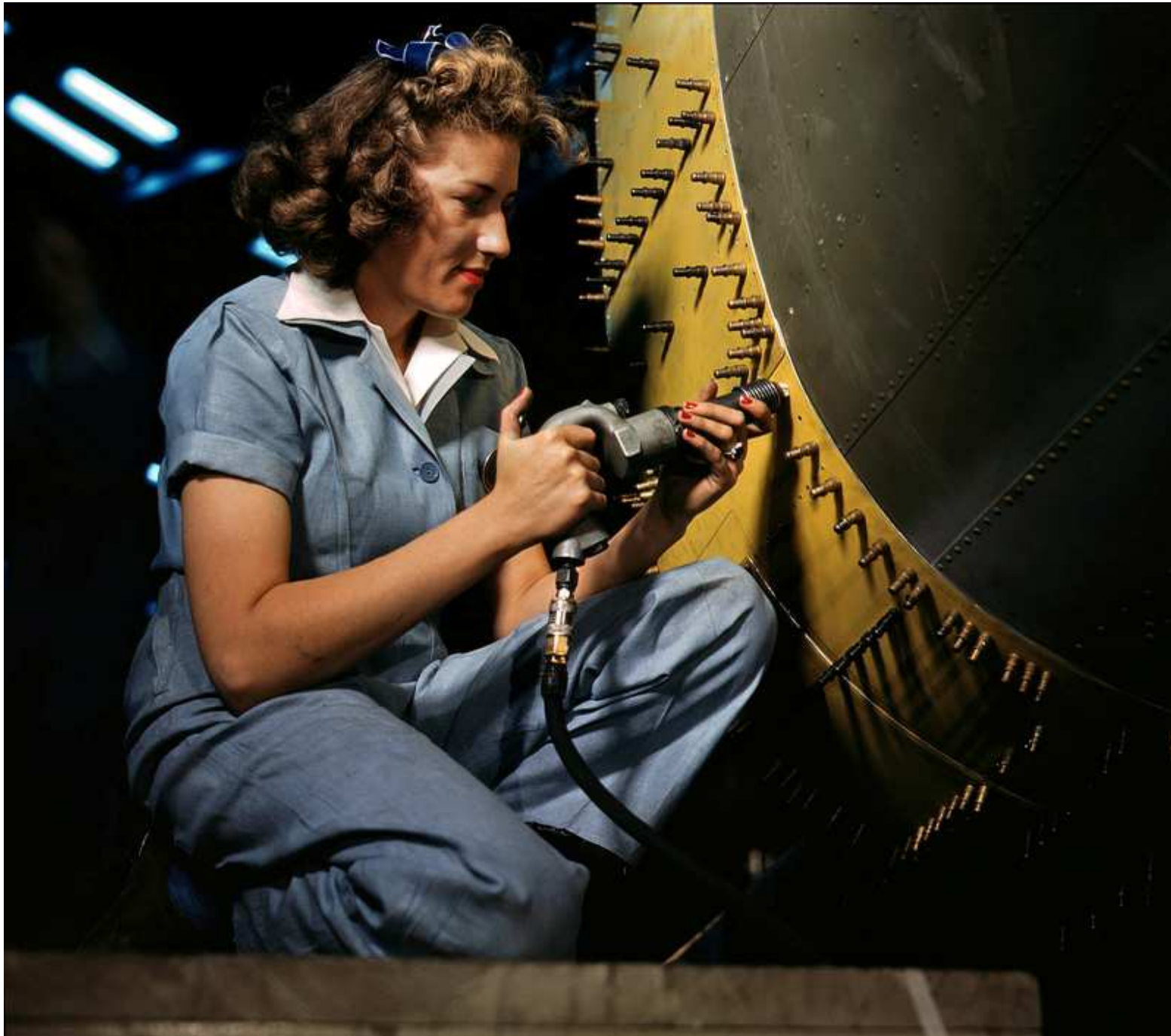
October 1942. Riveter at work on a bomber at the Consolidated Aircraft factory in Fort Worth.