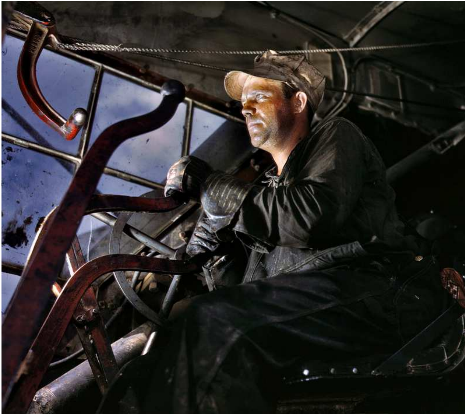
June 1942. Crane operator at Tennessee Valley Authority's Douglas Dam.