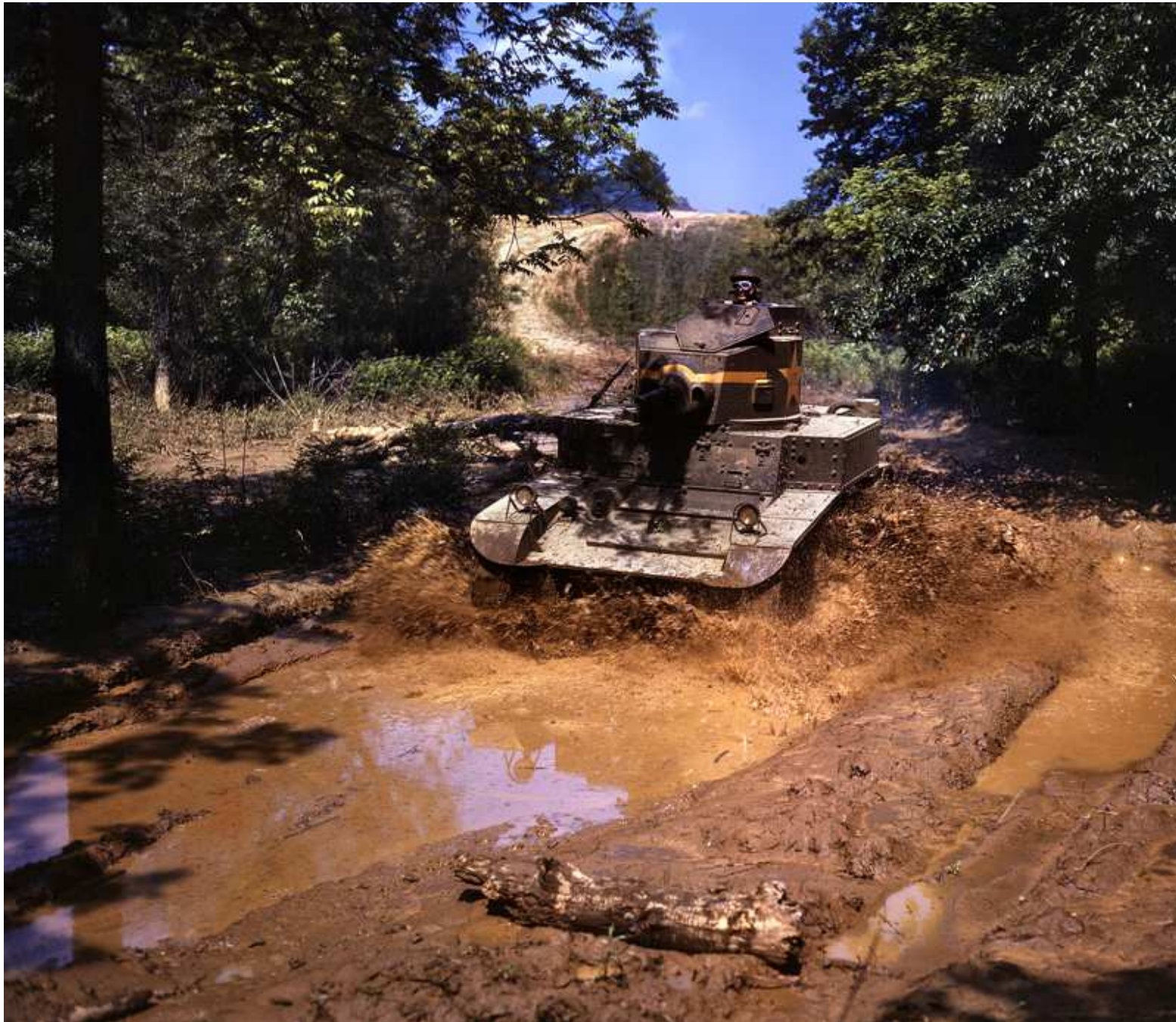
Fort Knox, June 1942. "Light tank going through water obstacle."