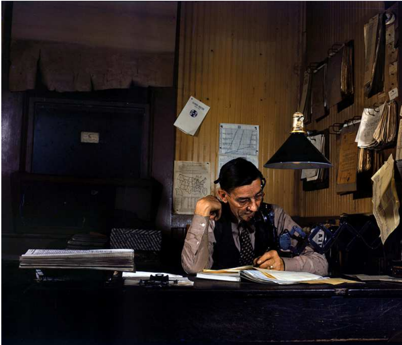
March 1943. Yardmaster at Amarillo, Texas, railyard.