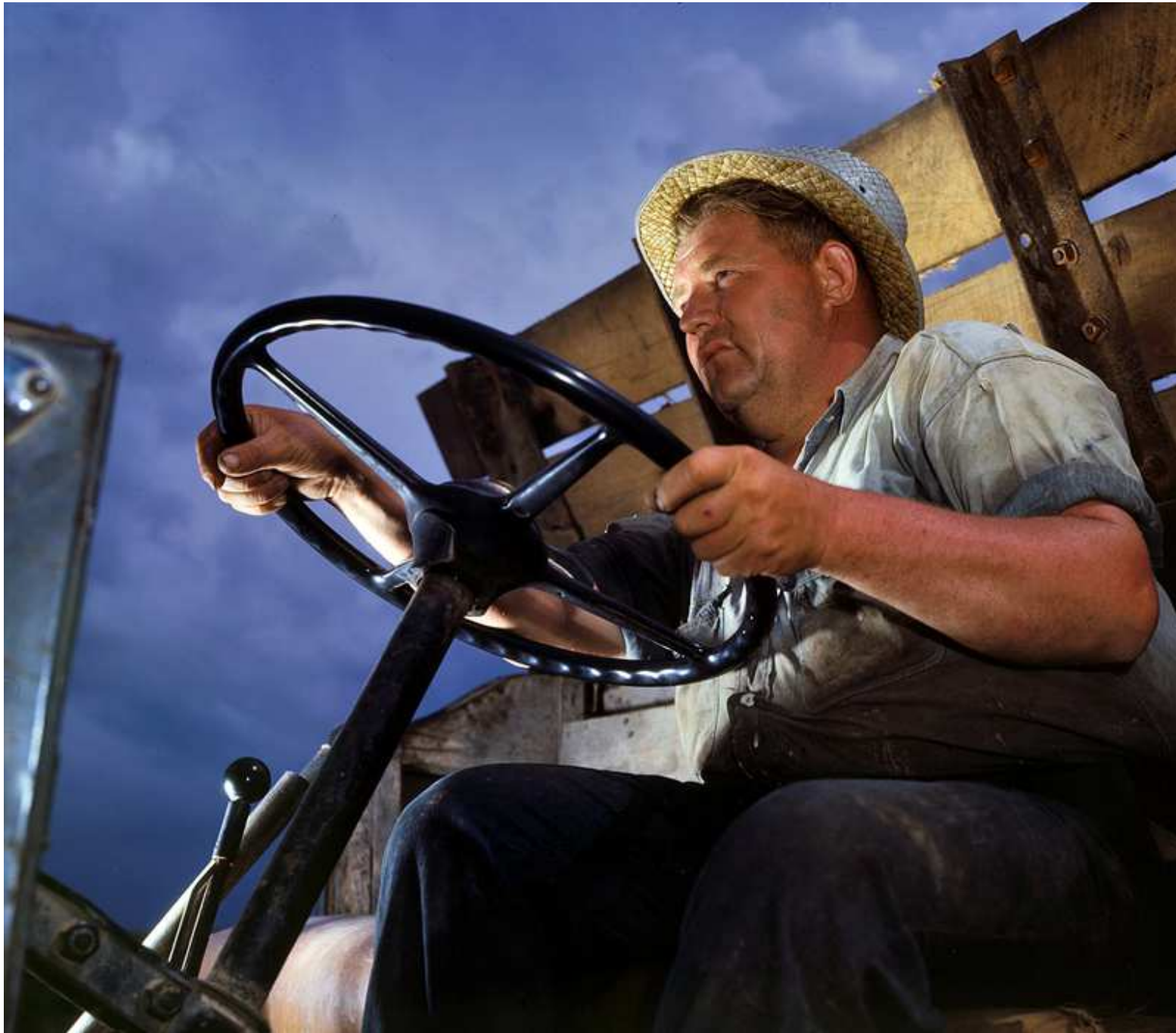
June 1942. Truck driver at the Tennessee Valley Authority's Douglas Dam. 33.