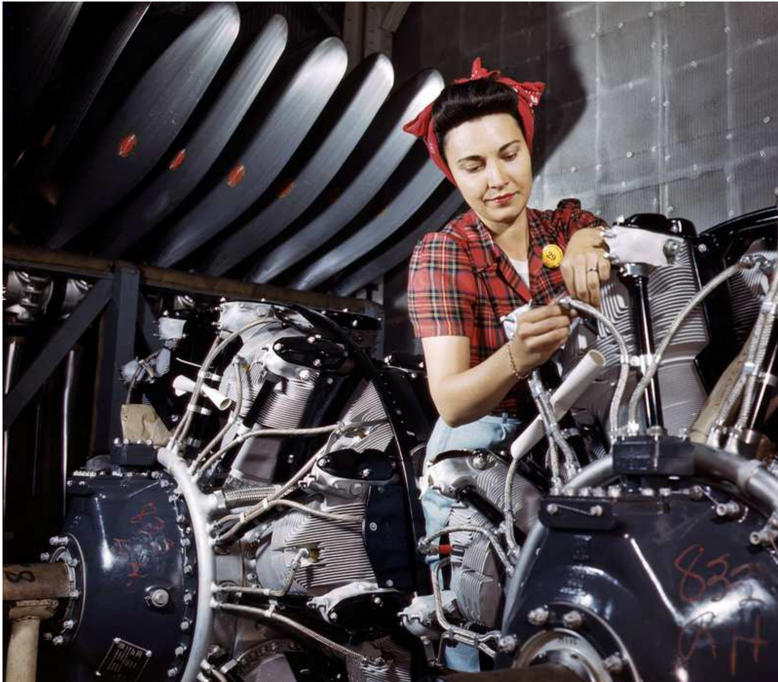
June 1942. Engine inspector for North American Aviation at Long Beach, California. 15.