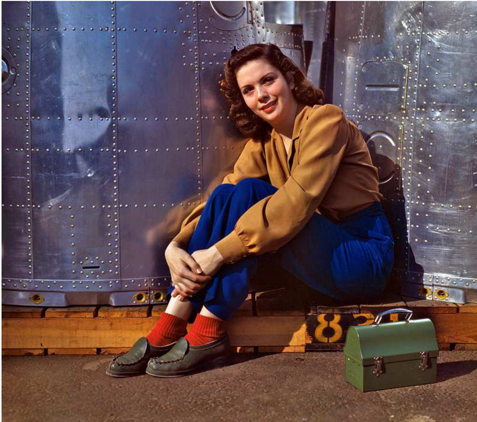
October 1942. "Noontime rest for an assembly worker at the Long Beach, Calif., plant of Douglas Aircraft Company. Nacelle parts for a heavy bomber form the background." 38.