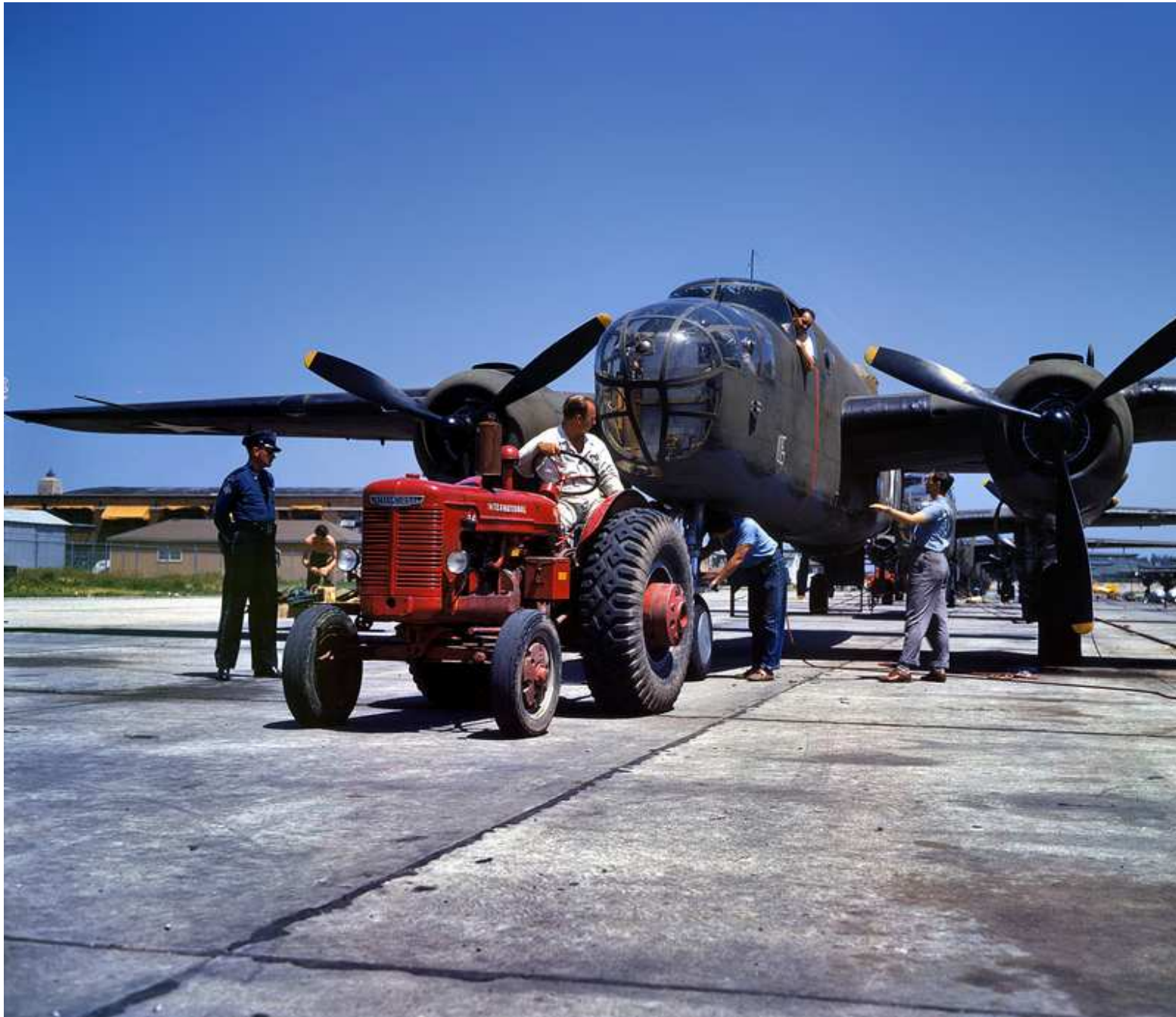
October 1942. Kansas City , Kansas . "B-25 bomber plane at North American Aviation being hauled along an outdoor assembly line." 4x5 Kodachrome transparency by Alfred Palmer for the Office of War Information.