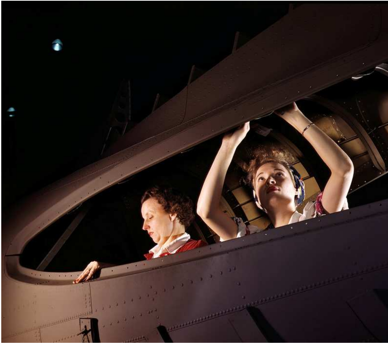
October 1942. "American mothers and sisters, like these women at the Douglas Aircraft Company plant in Long Beach, California, give important help in producing dependable planes for their men at the front."