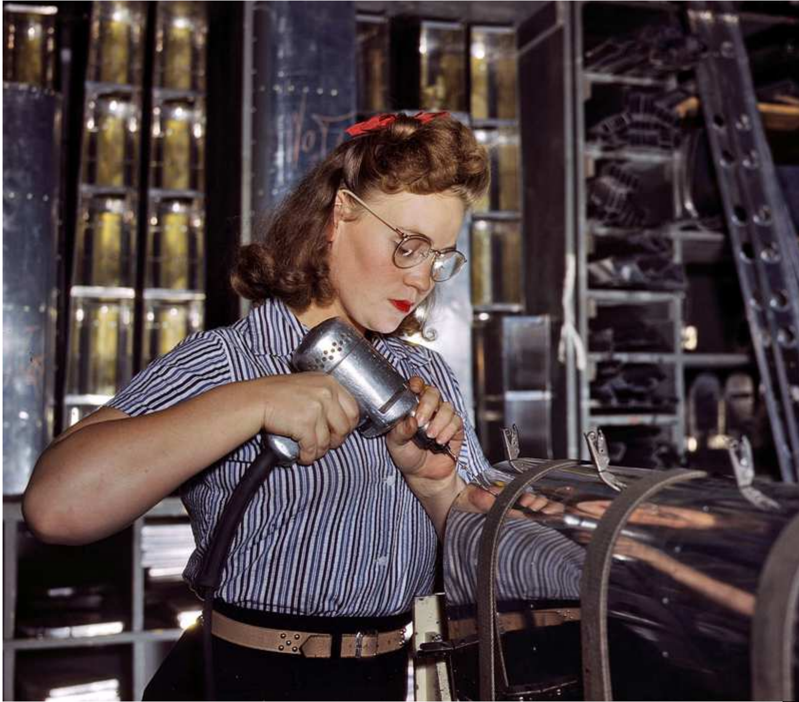
October 1942. Inglewood , California . North American Aviation drill operator in the control surface department assembling horizontal stabilizer section of an airplane. 4x5 Kodachrome transparency by Alfred Palmer.