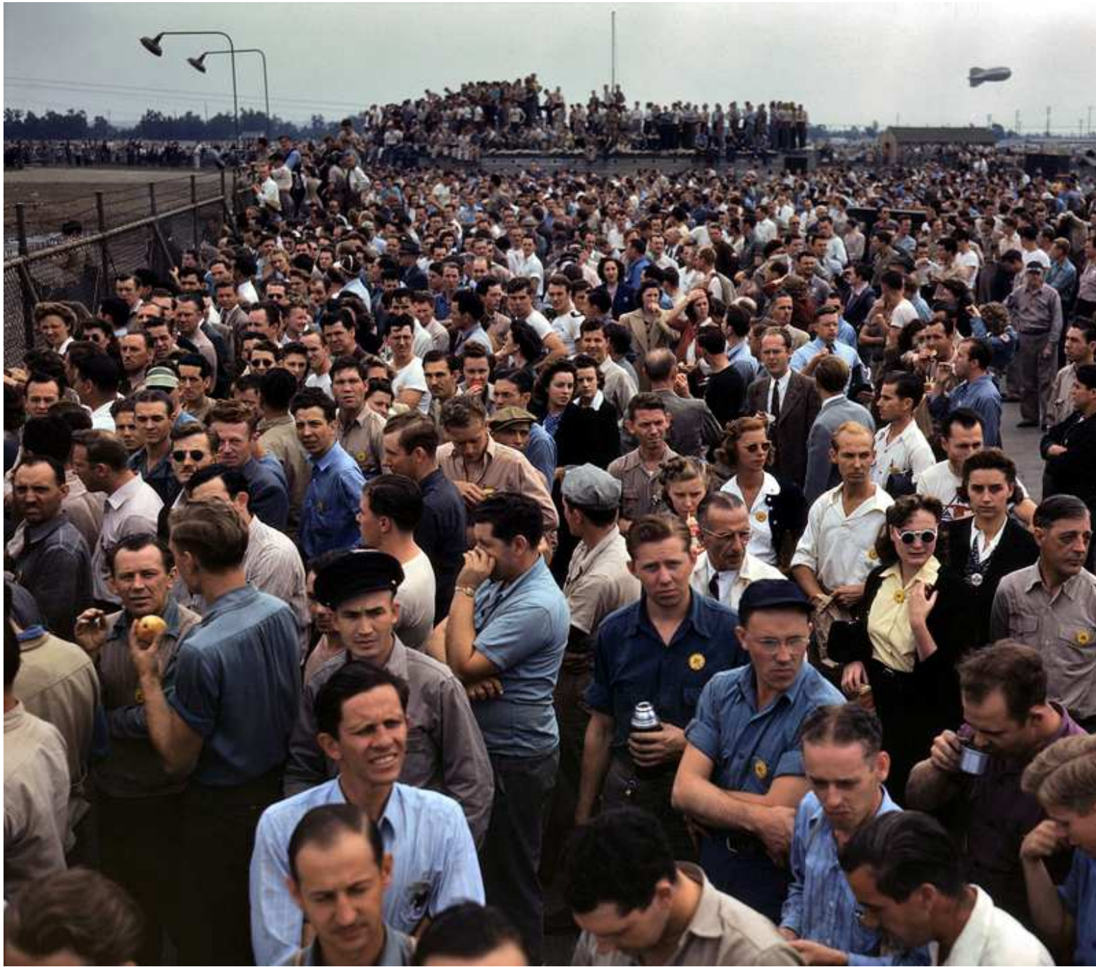
October 1942. "Thousands of North American Aviation employees at Inglewood, California, look skyward as the bomber and fighter planes they helped build perform overhead during a lunch period air show. This plant produces the battle-tested B-25 'Billy Mitchell' bomber, used in General Doolittle's raid on Tokyo, and the P-51 'Mustang' fighter plane, which was first brought into prominence by the British raid on Dieppe."