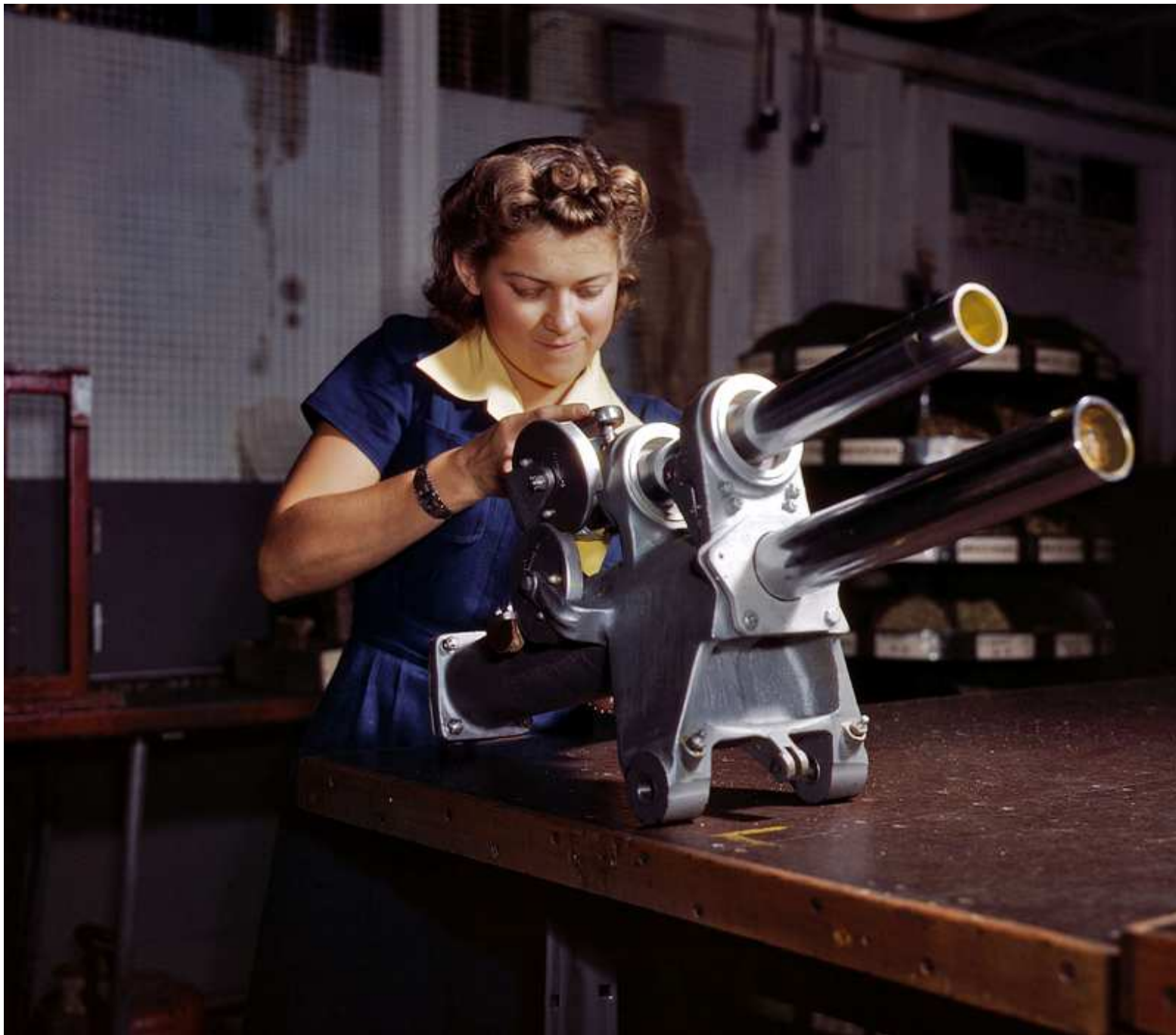
October 1942. Inglewood, California. "Young woman employee of North American Aviation working over the landing gear mechanism of a P-51 fighter plane." 13.