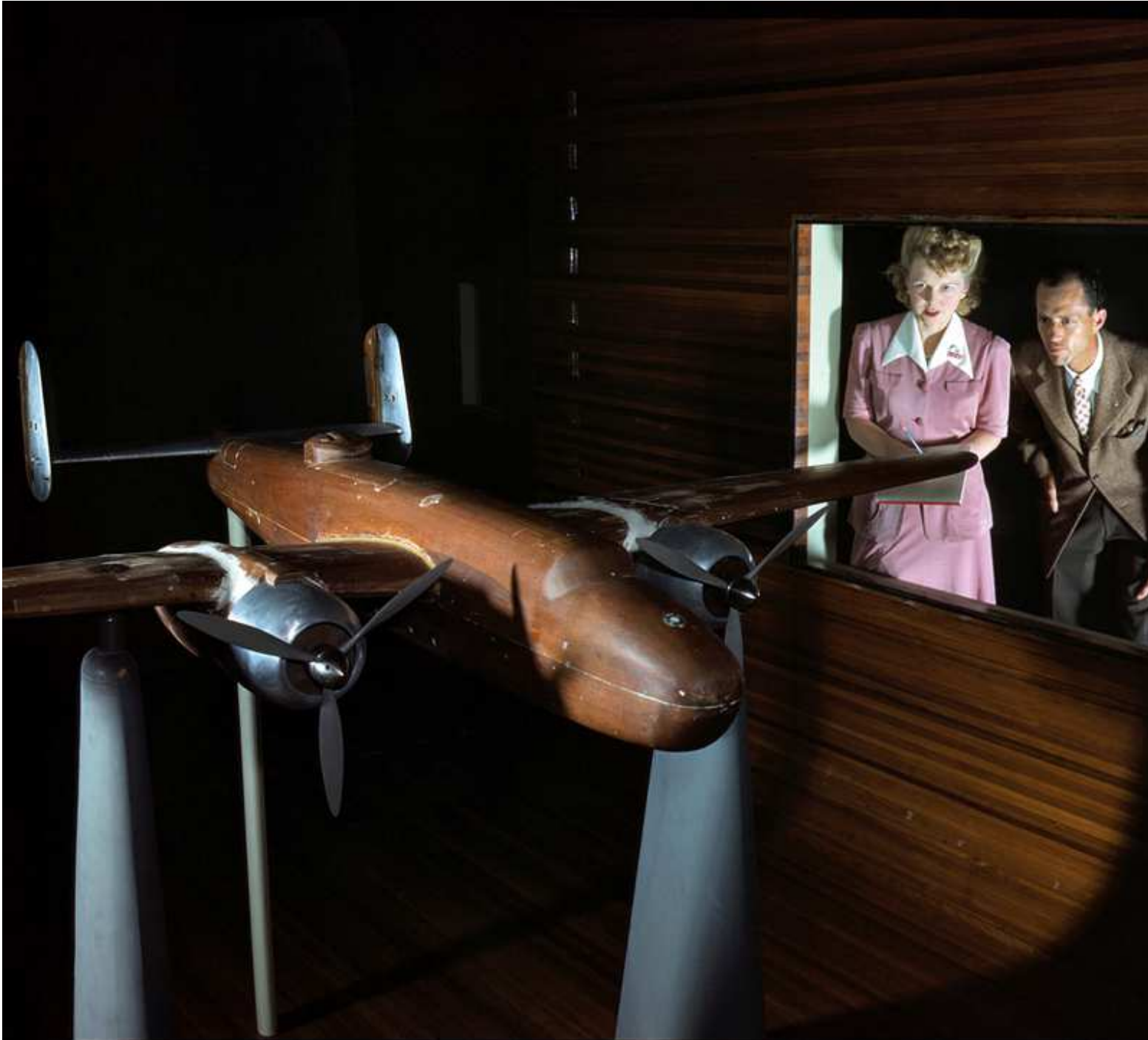
October 1942. Experimental staff at the North American Aviation plant in Ingle- wood, Calif. observing wind tunnel tests on a model of the B-25 ("Billy Mitchell") bomber.