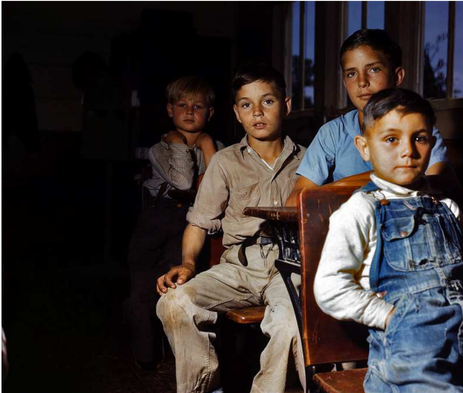
April 1943. Schoolchildren in San Augustine County, Texas.