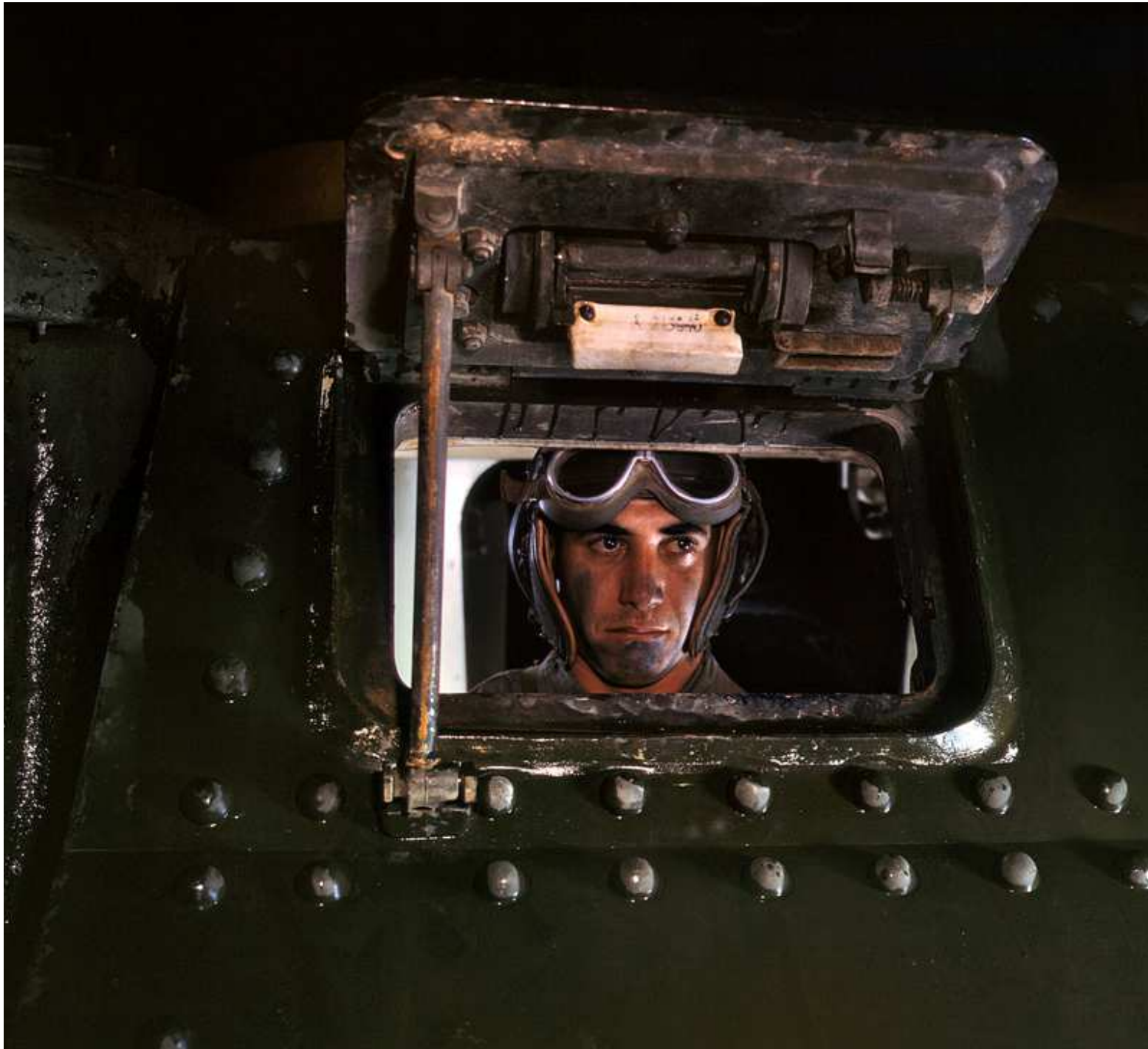
June 1942. Army tank driver at Fort Knox, Kentucky.