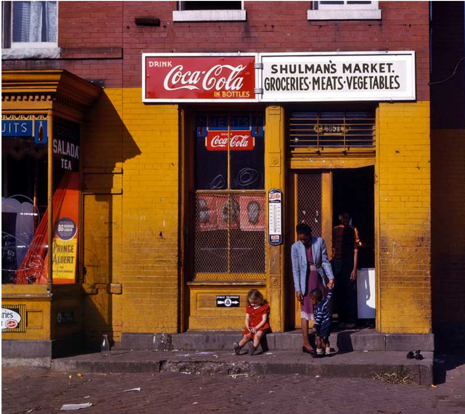
Shulman's Market at N and Union Street SW, Washington. Alternate view. In one of the many comments for this post, an alert FOS (Friend of Shorpy) points out the posters of Axis leaders Mussolini, Hitler and Admiral Yamamoto in the window. Along the bottom of each it says What do YOU say America?