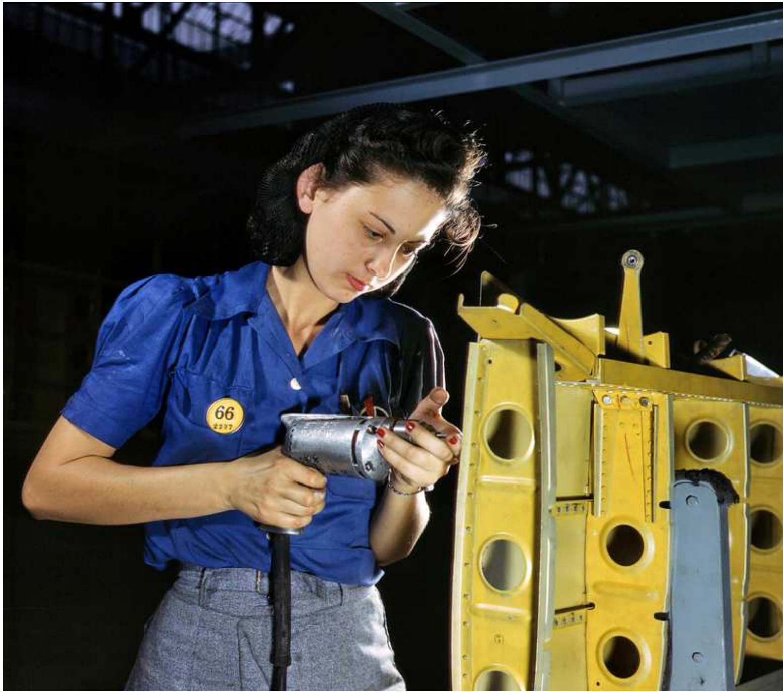
February 1943. Working on the horizontal stabilizer of a "Vengeance" dive bomber at the Consolidated-Vultee plant in Nashville.