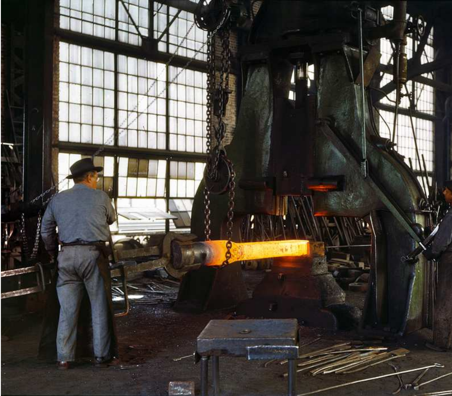
March 1943. "Santa Fe R.R. shops, Albuquerque. Hammering out a drawbar on the steam drop hammer in the blacksmith shop."