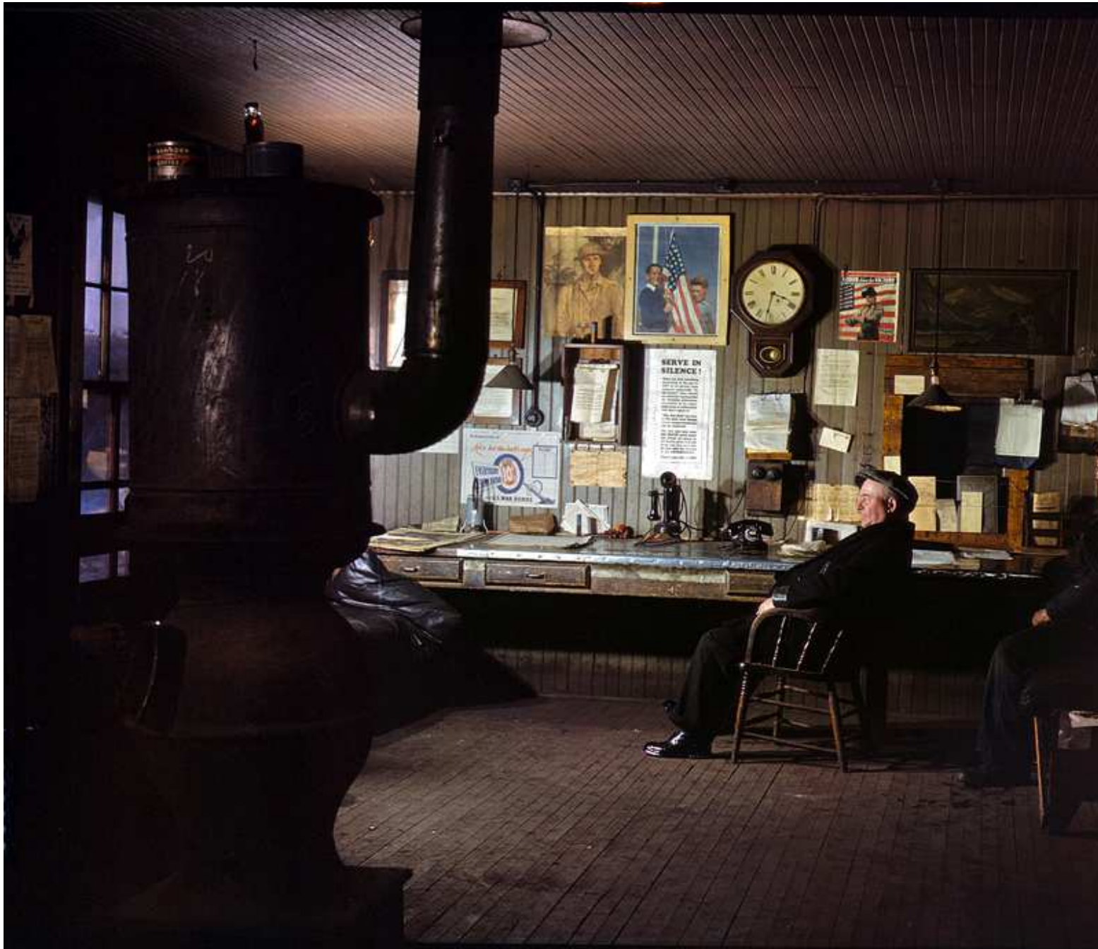
December 1942. A winter afternoon in the North Proviso yardmaster's office, Chicago & North Western Railroad. Click here for a closeup of the poster on the wall.