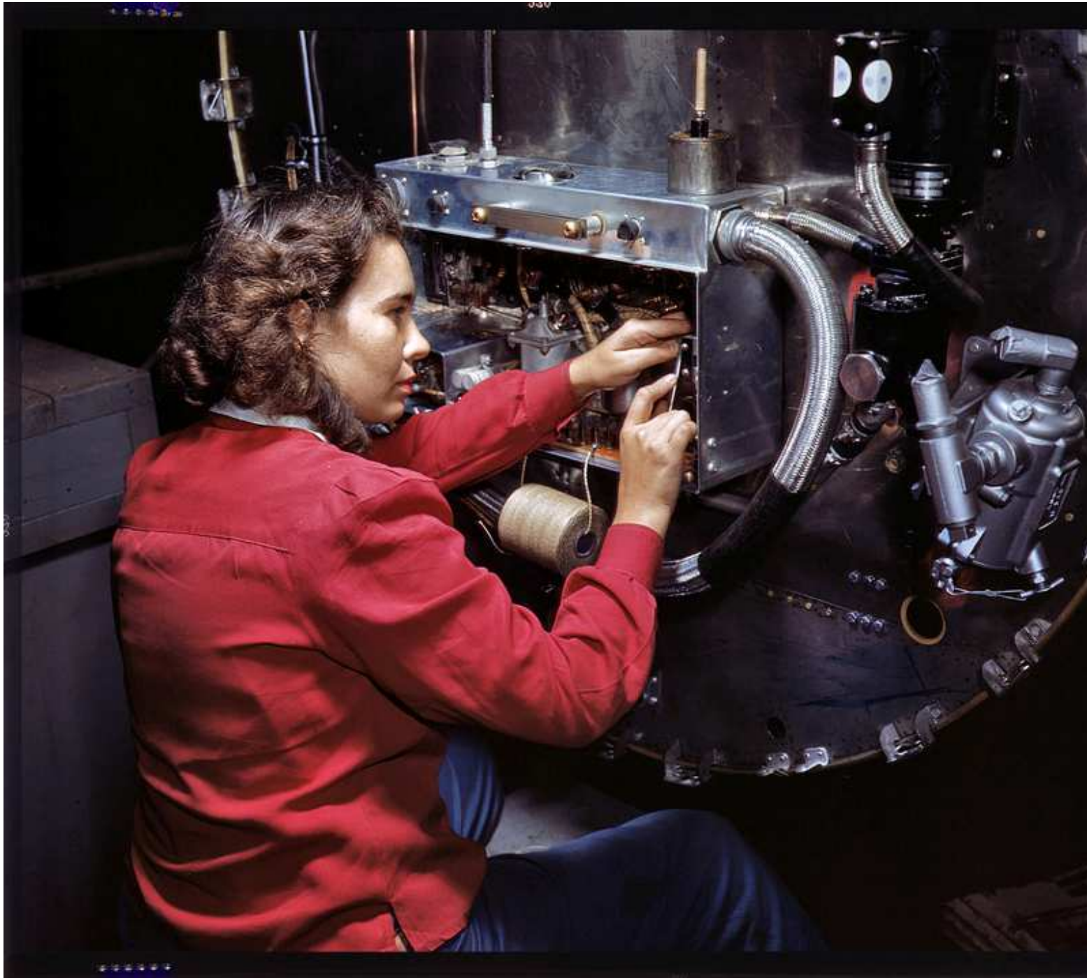
October 1942. Assembling switchboxes on the firewalls of B-25 bombers at North American Aviation's Inglewood, California, factory.