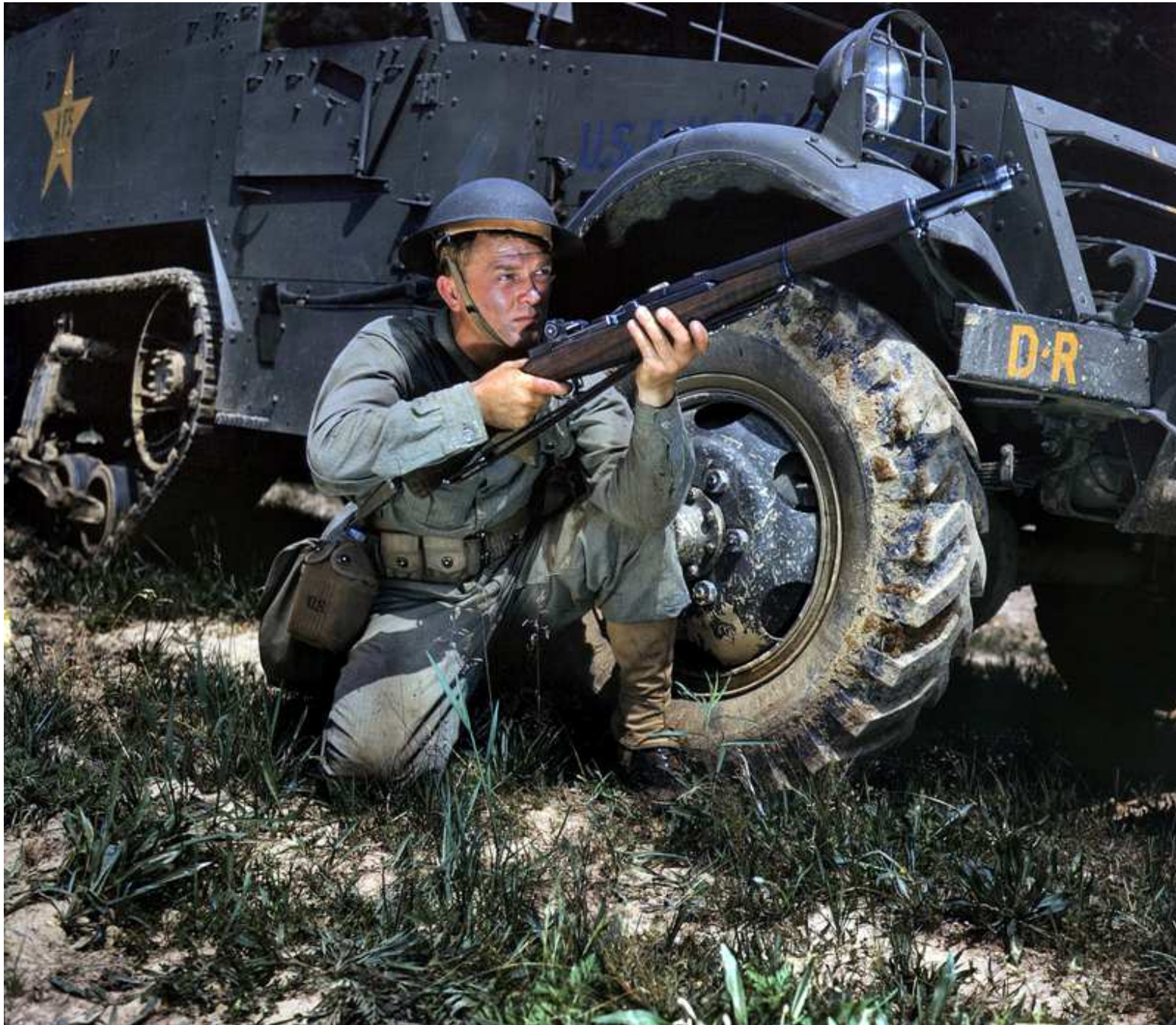
June 1942. Fort Knox, Kentucky. "Infantryman with halftrack. A young soldier sights his Garand rifle like an old-timer. He likes the piece for its fine firing qualities and its rugged, dependable mechanism."