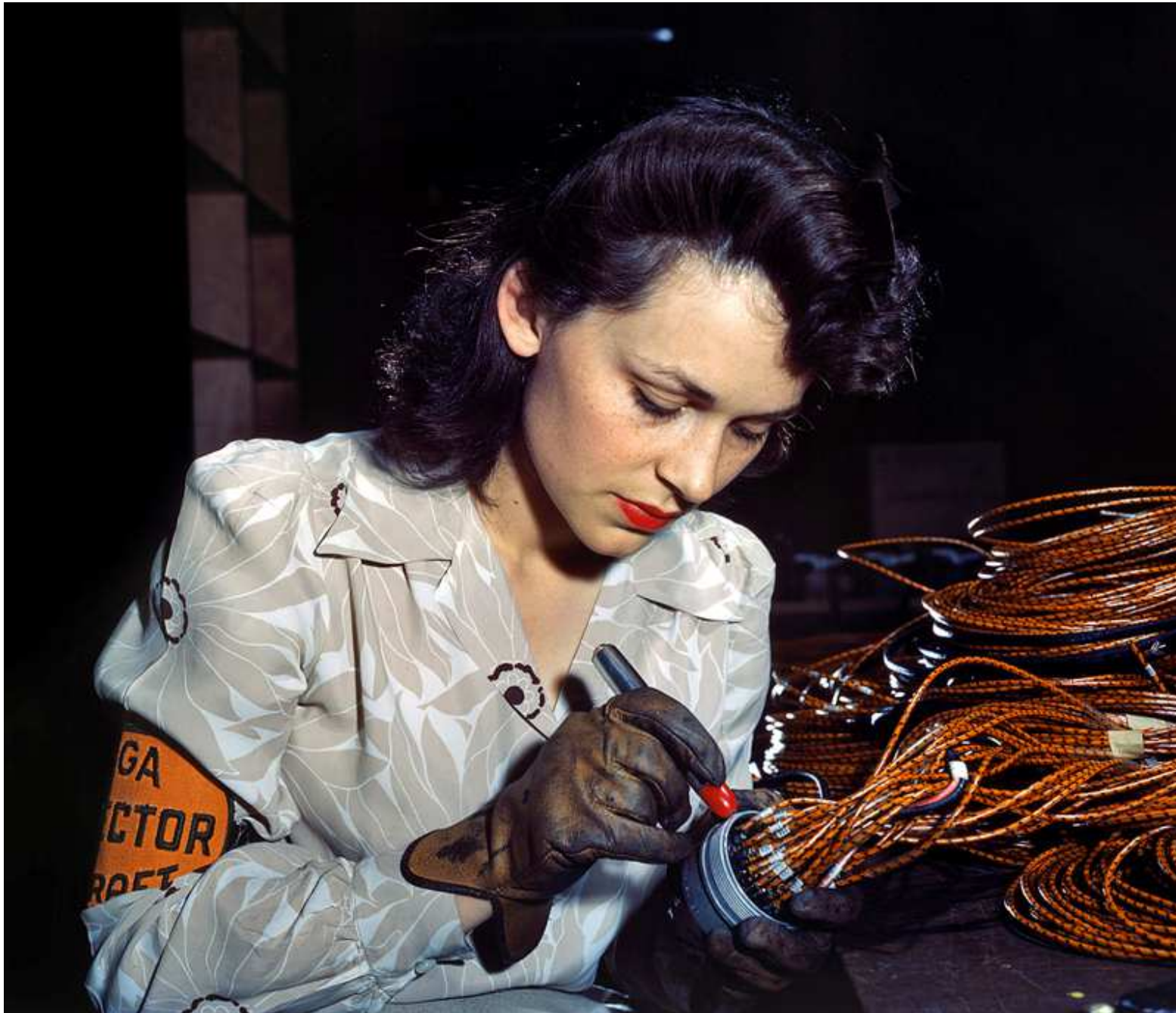
June 1942. Lockheed Vega aircraft plant at Burbank, California. "Hollywood missed a good bet when they overlooked this attractive aircraft worker, who is shown checking electrical sub-assemblies."