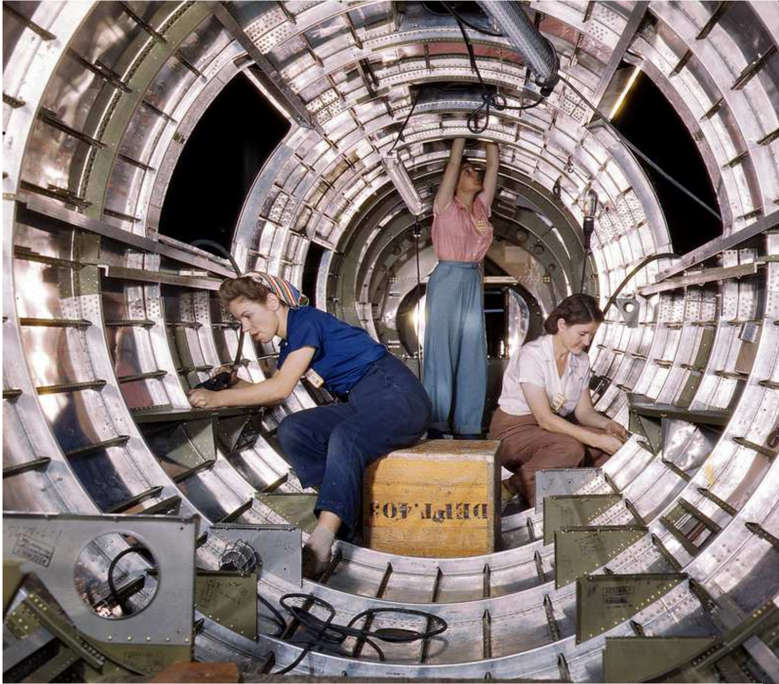
October 1942. Workers installing fixtures and assemblies in the tail section of a B-17F bomber at the Douglas Aircraft Company plant in Long Beach, California.