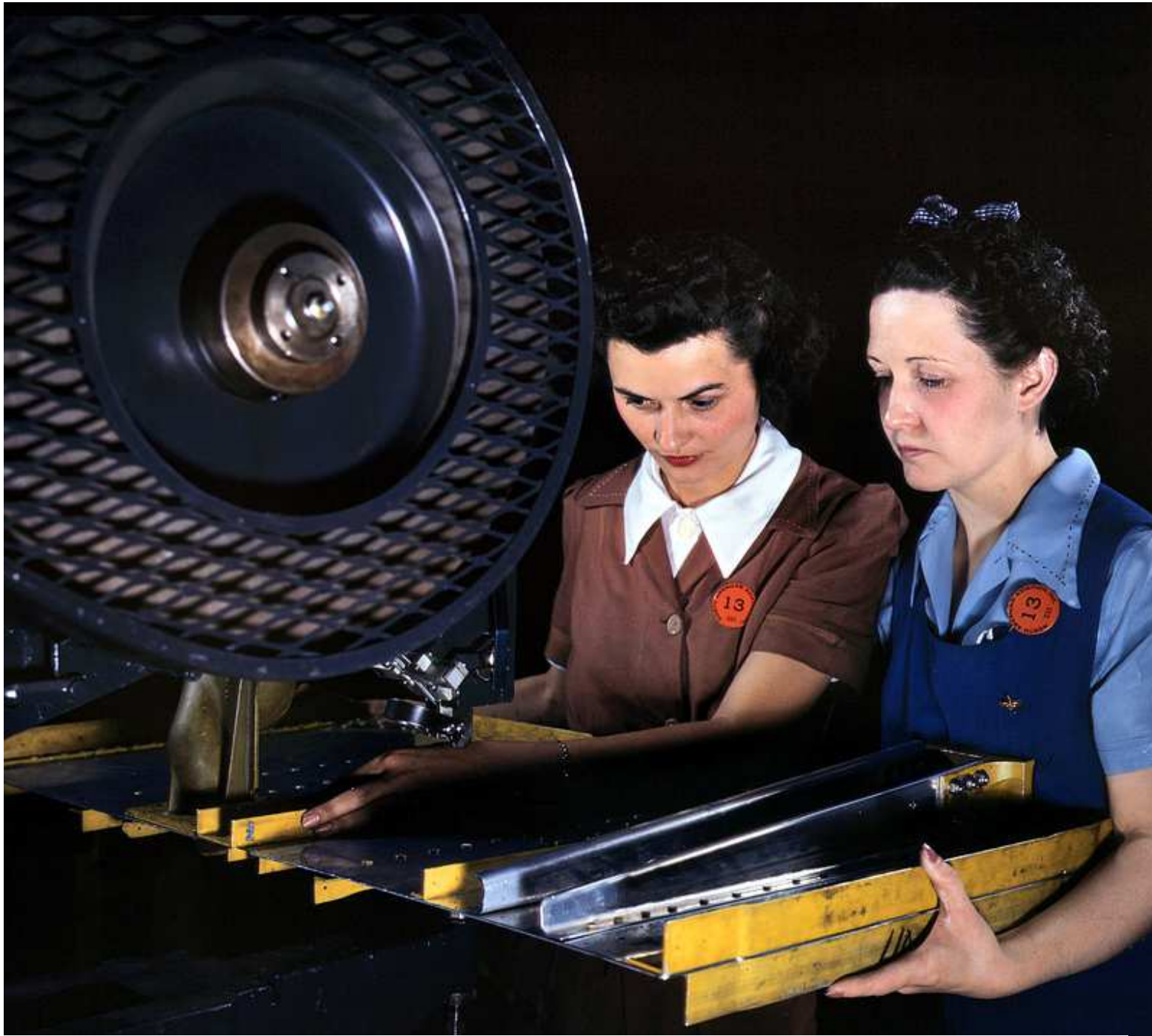
June 1942. Inglewood, California. "Punching rivet holes in a frame member for a B-25 bomber at North American Aviation."