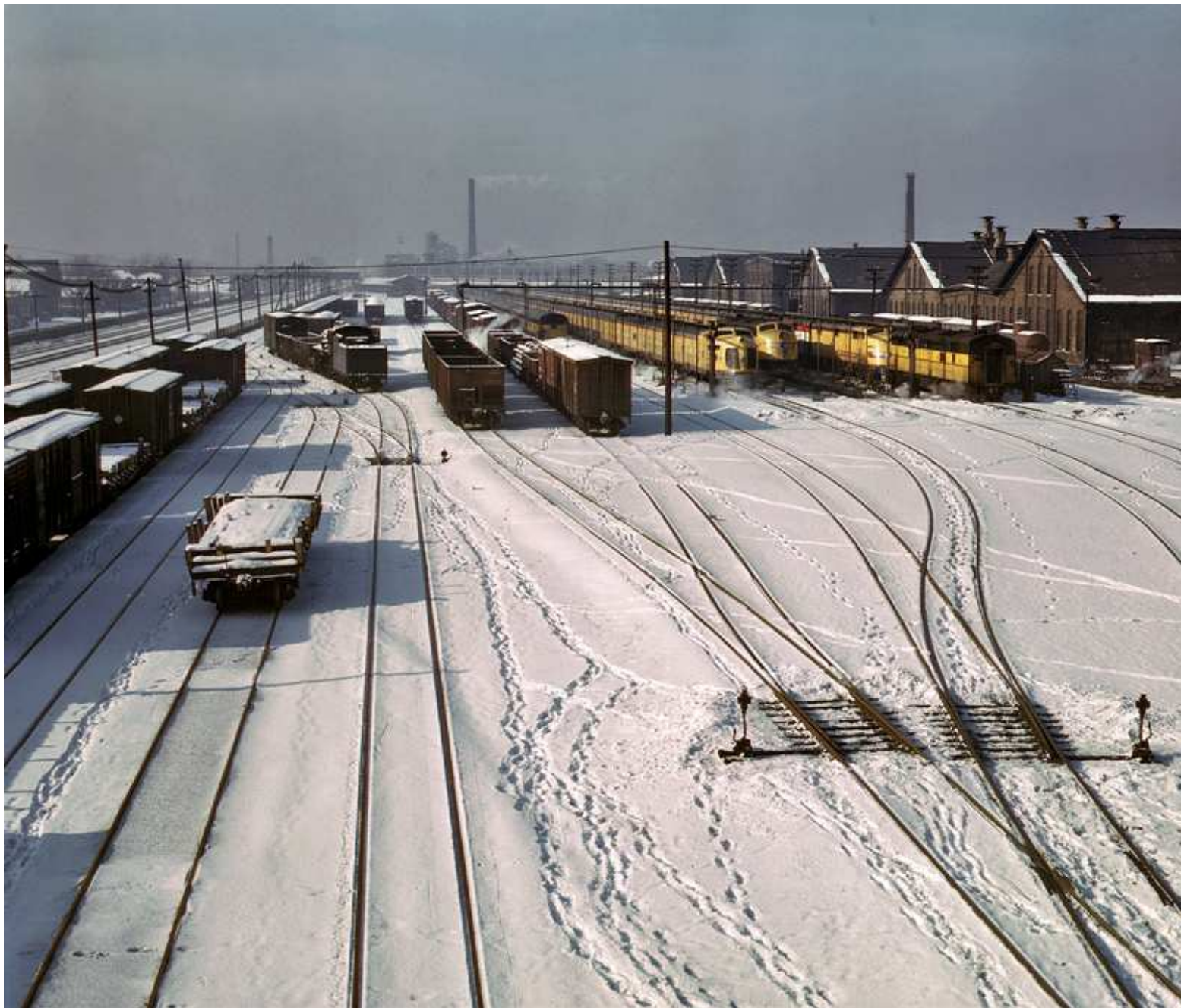
December 1942. Three West Coast streamliners in the Chicago & North Western yards at Chicago. 4x5 Kodachrome transparency by Jack Delano.