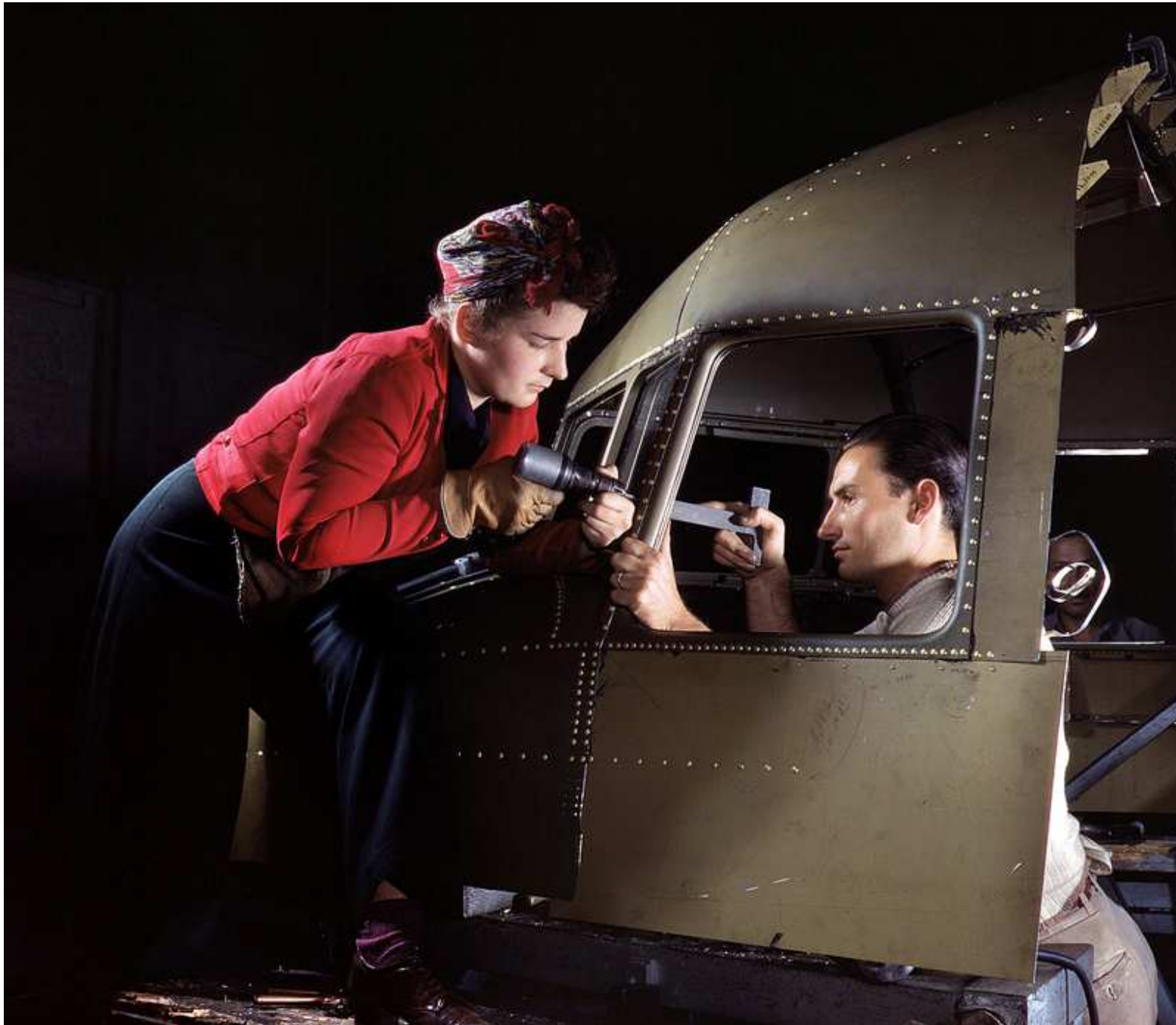
942. Inglewood , California . Riveting team working on the cockpit shell of a C-47 heavy transport at North American Aviation. "The versatile C-47 performs many important tasks for the Army. It ferries men and cargo across the oceans and mountains, tows gliders and brings paratroopers and their equipment to scenes of action." 4x5 Kodachrome transparency by Alfred Palmer for the Office of War Information.