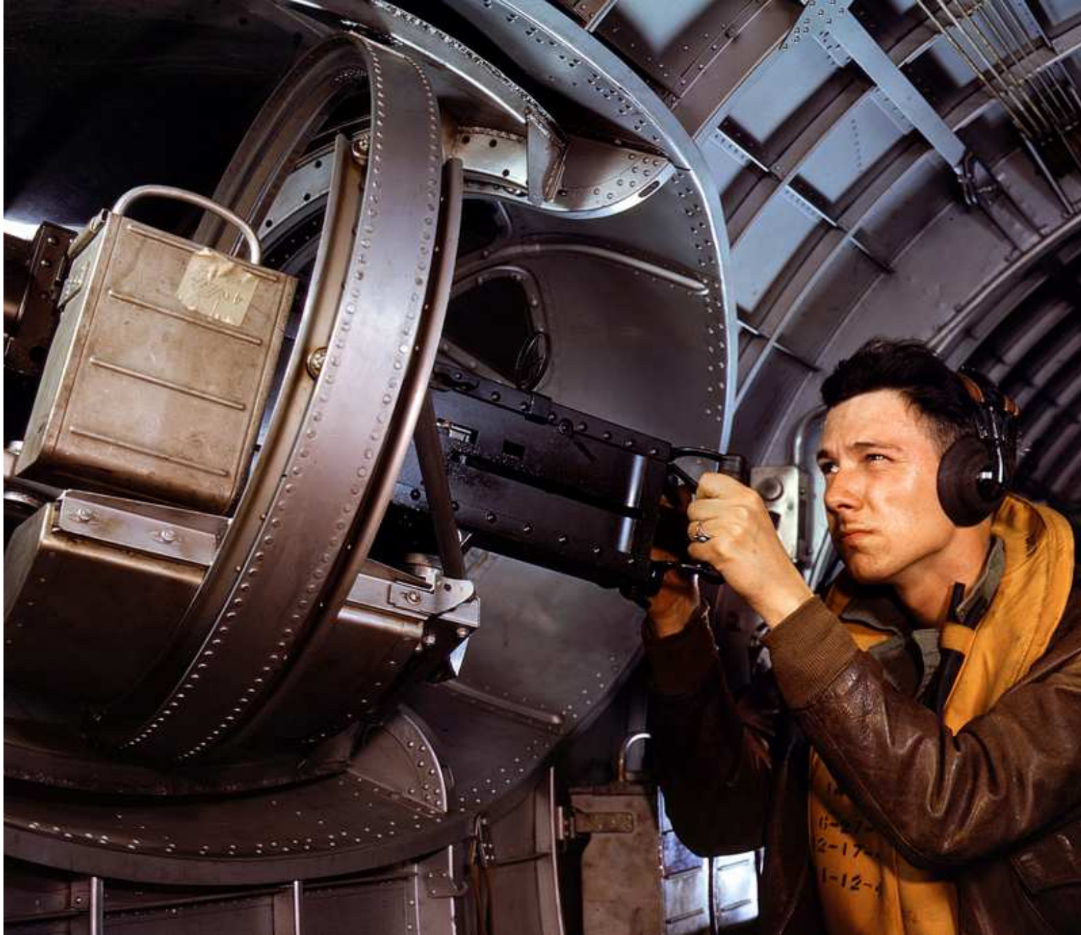
May 1942. Langley Field, Virginia. YB-17 bombardment squadron.