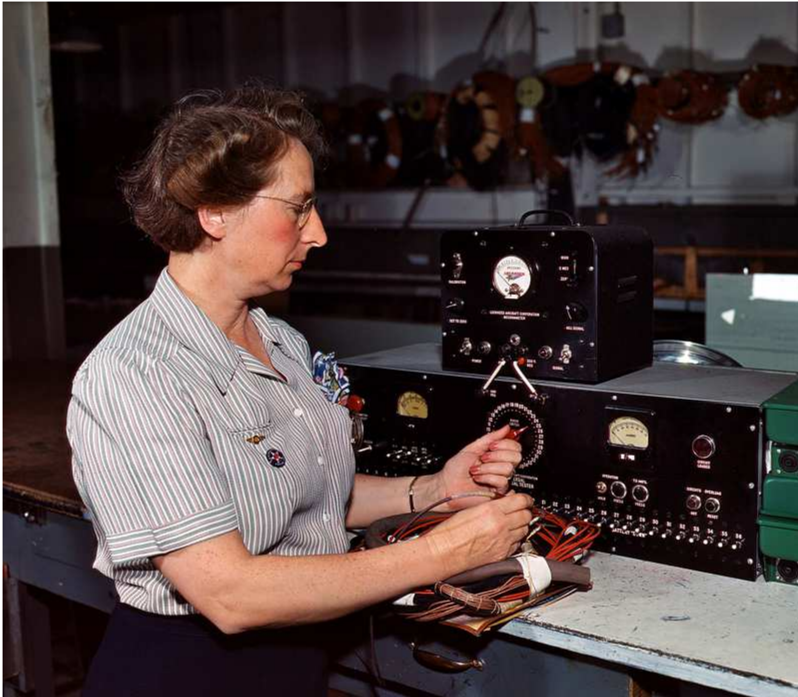
October 1942. "Testing electric wiring at Douglas Aircraft Company. Long Beach, California."